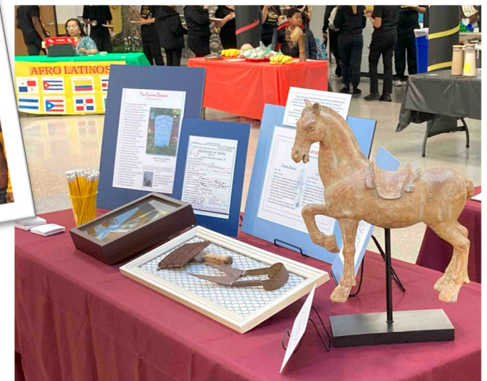
Above: Cavalry detail of our U.S. Colored Troops traveling exhibit