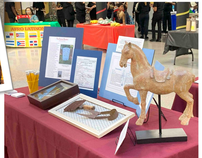
Above: Cavalry detail of our U.S. Colored Troops traveling exhibit